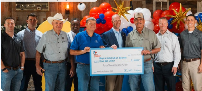
Members of Valero’s Three Rivers leadership team present checks to receiving agencies

“The contribution the Boys & Girls Club (BGCA) of Live Oak County received this year from the Benefit for Children will fund our Triple Play Program. Triple Play, BGCA’s comprehensive health and wellness initiative, strives to improve the overall health of members, ages 6-18, by increasing their daily physical activity, teaching them good nutrition and helping them develop healthy relationships. The importance of these funds cannot be understated, as they allow the Boys & Girls Club of Live Oak County to impact the lives of hundreds of children throughout the two rural communities we serve.”