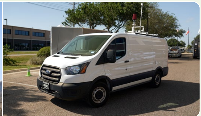
Our GMAP van's real-time readouts tour fenceline communities and allow for early response and mitigation actions even on small emissions sources.