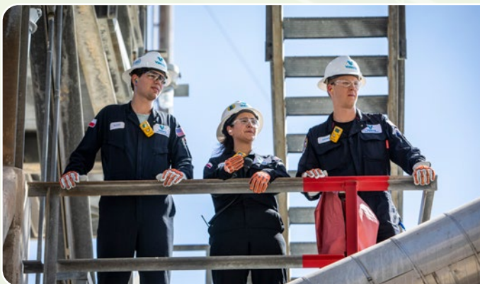
At Valero, we are consistently evaluating projects and looking for ways to further reduce our water consumption.

Five-Gas Monitors are routinely used by personnel within the refinery for measuring H 2 S, SO 2 , CO, oxygen and lower explosive limit (LEL) levels for safety purposes and also as early detection to identify and correct issues that could impact ambient air quality.