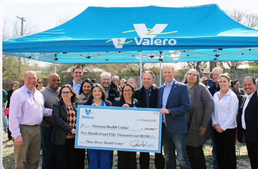
Pictured: Valero Three Rivers leadership, along with representatives from Atascosa Health Center, Inc.